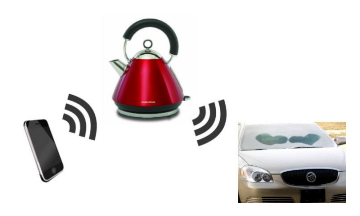
Internet of Things

And what does it matter? Well from Process Instruments' point of view, it doesn't. As long as our products are leading the way in providing our customers with what they need to enable their own Industry 4.0.