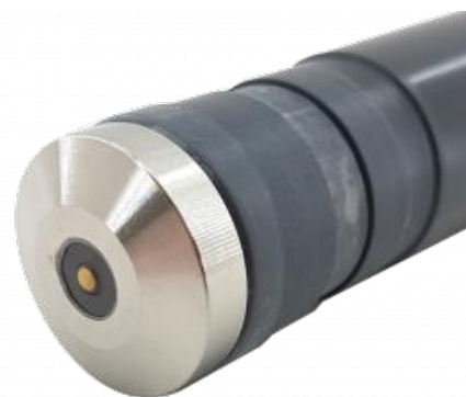
Peracetic Acid Sensor

PAA has been primarily used as a cleanser and disinfectant in the food industry since the 1950's, particularly for fruit and vegetable washing due to its highly effective anti-microbial properties. All disinfectants applied directly to food must not leave harmful residual by-products, which is why PAA is so widely used in this industry around the world. Other industries in which the water cleanliness is of paramount importance have also turned to PAA for disinfection including; agricultural, dairy processing, wineries, breweries and even cooling towers.