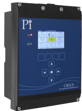
CRIUS® PeraSense Controller

The PeraSense has the option to come with full PID and output controls, which are completely user configurable to provide the site with the ability to make the instrumentation suit their needs. Pi's controllers can also offer the option for remote access, which provides site or servicing contractors the ability to remotely monitor the live levels of PAA, trend historic data, view system alarms, remotely configure settings and much more.