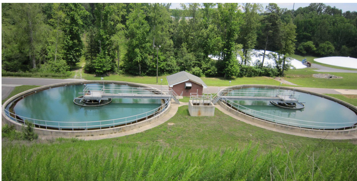
Water treatment site

Generally though, in a 'Flashy River' source Streaming Current technology does give reliable coagulation control.